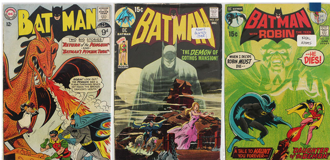
Lots 723, 727, 728: Batman #155, #227, #232. Hammer: £260, £340, £320.